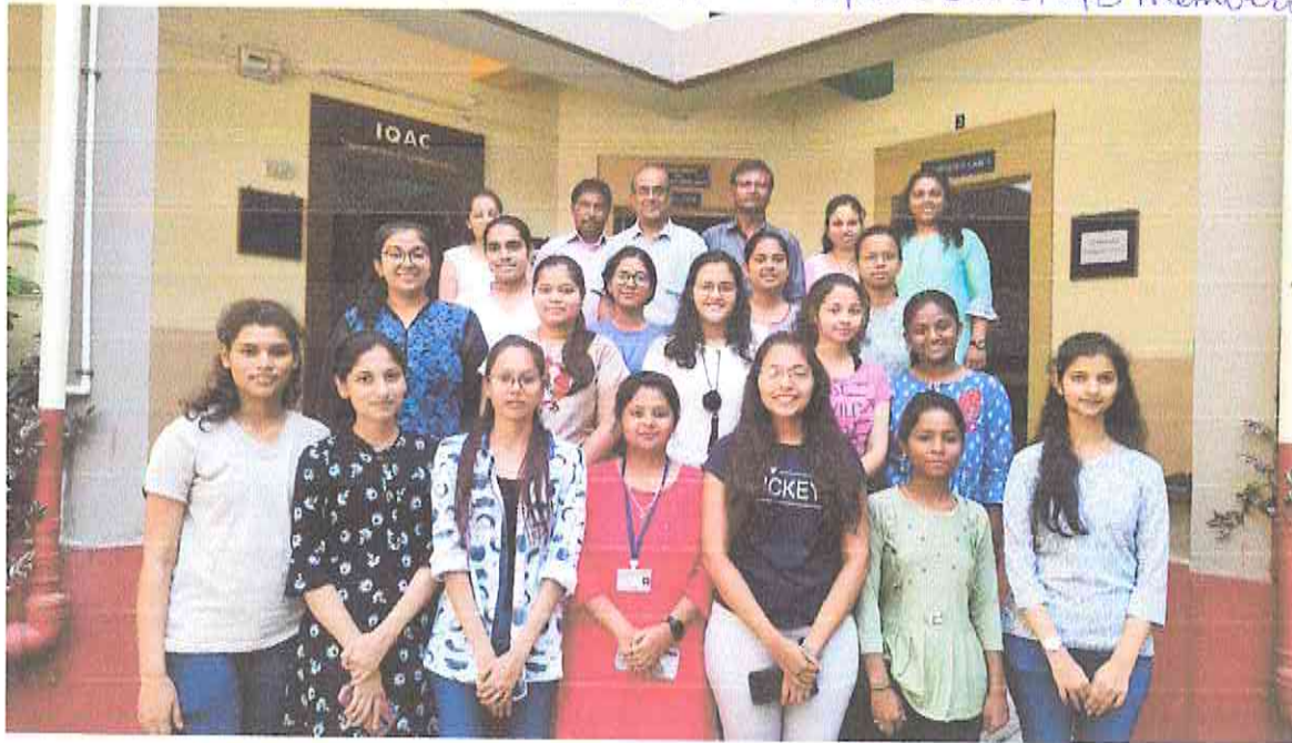
Photos of the programme: students with Principal and staff members (CNCVOW)