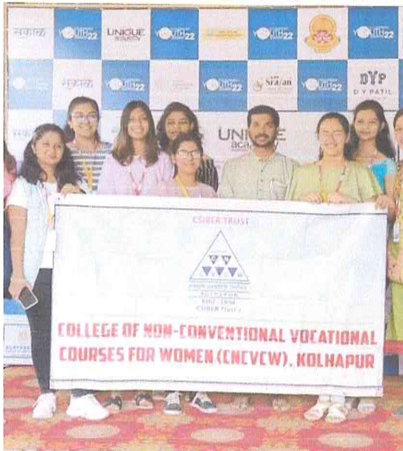
Students with 'VIN' Programme Officers

Helena PRINCIPAL, College of Non-Conventional Vocational Courses For Women Kolhapur