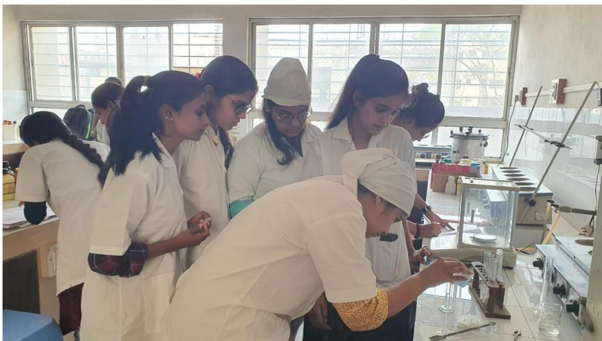
M.Sc. (FSN) I Students performing Analytical Practicals

Well-equipped classrooms and laboratories with ICT facility are available in the campus.