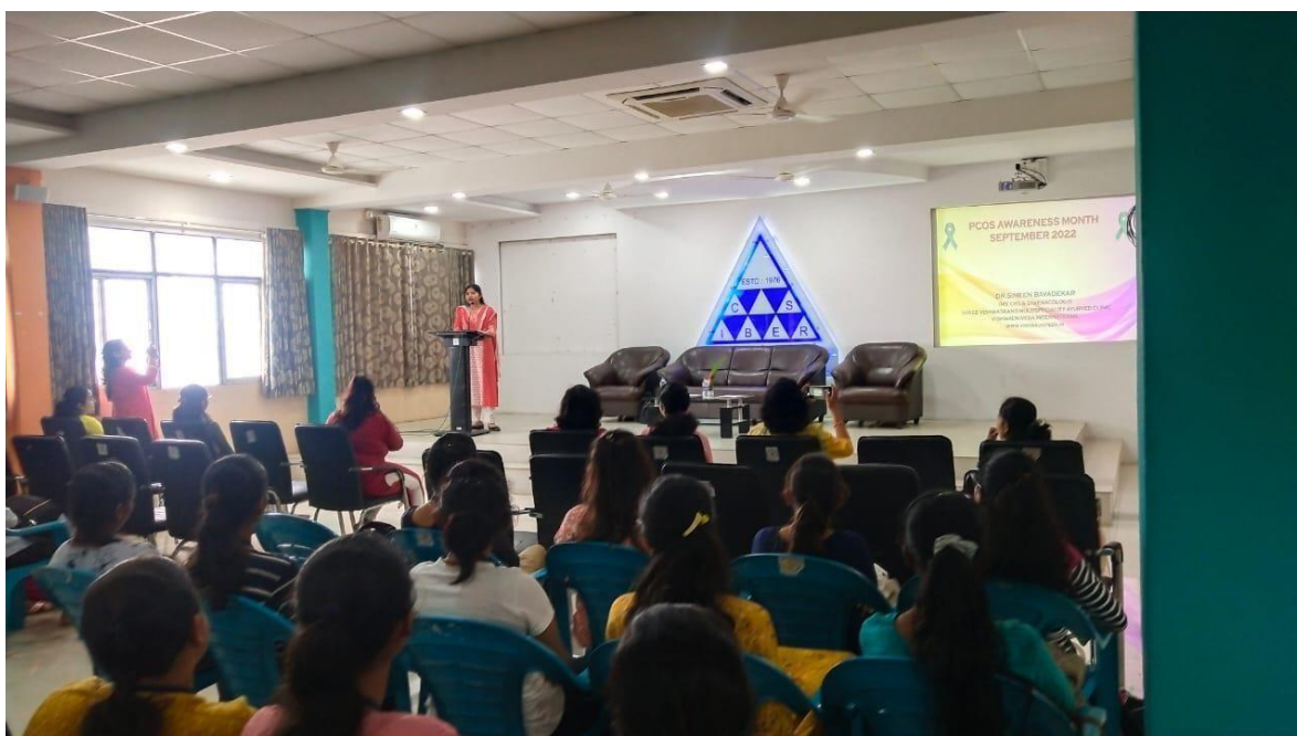
Industry Institute Interaction

The department of Food Technology organizes Industry Institute Interaction under which a workshop is organized wherein the professionals from Food & Nutrition industry interact with the students. The main objective of Industry Institute Interaction is to bridge the gap between Academics and actual requirements of industry.