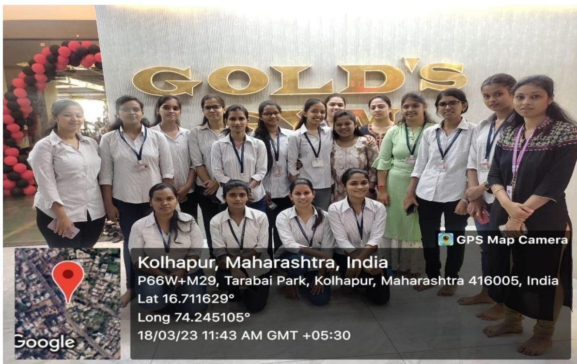
Field Visit at Golds Gym, Kolhapur.

Department of Food Technology has MoU with Dept. of Food Science and Technology, Shivaji University Kolhapur, Bureau Veritas, India and Gold's Gym Kolhapur, under which various types of trainings, visits, workshops, competitions etc. are conducted for the students.