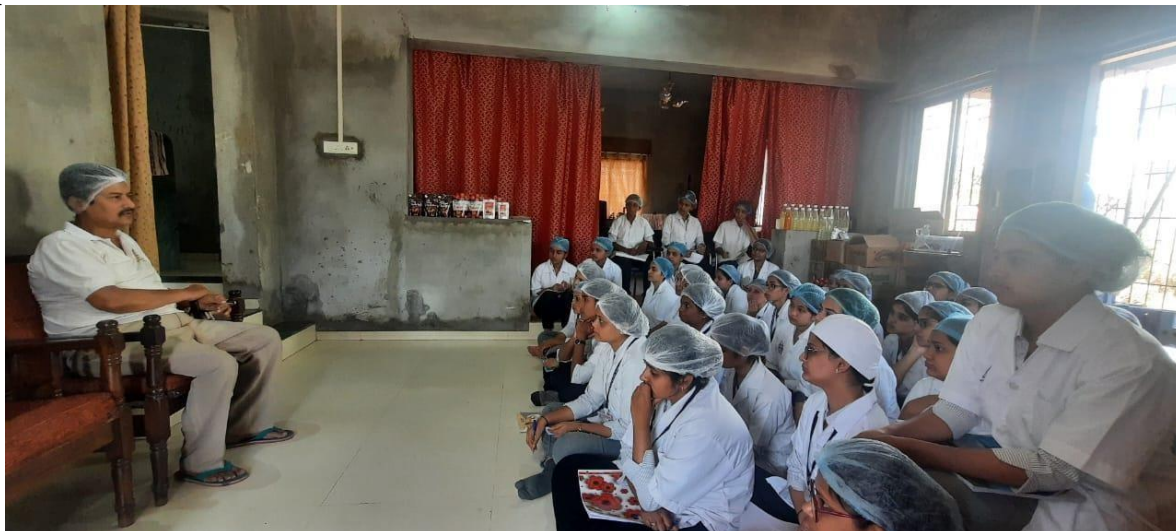
M.Sc.(FSN) I & II students Field Visit at Piyush Canning Centre, Morewadi