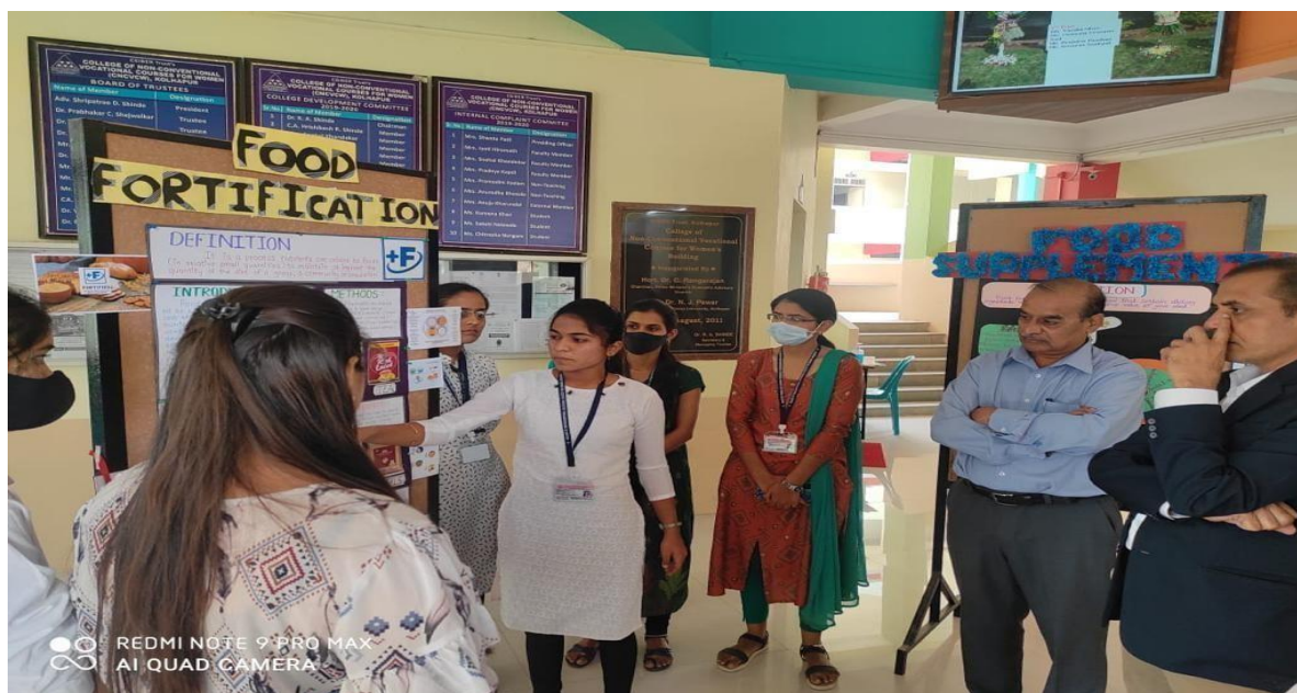
M.Sc. (FSN) I Wall Paper display Activity