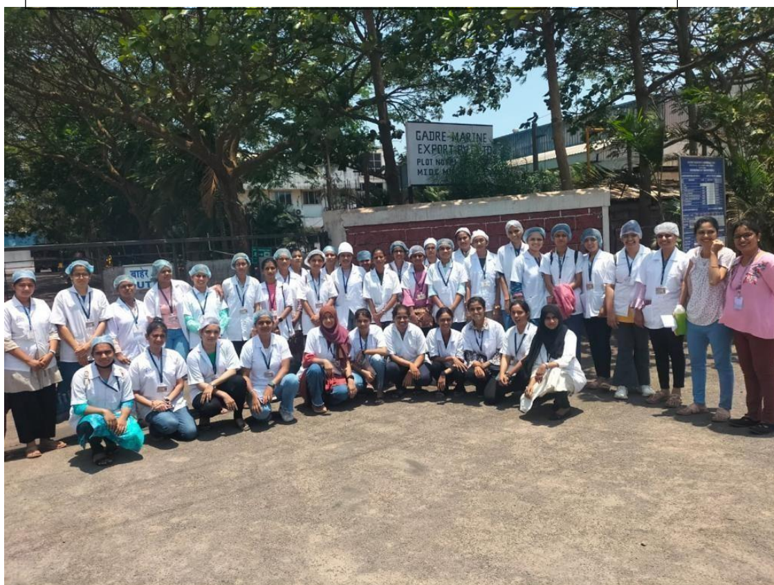
Study Tour of M.Sc. FSN I and II students at Gadre Marine Industries Pvt. Ltd., Ratnagiri