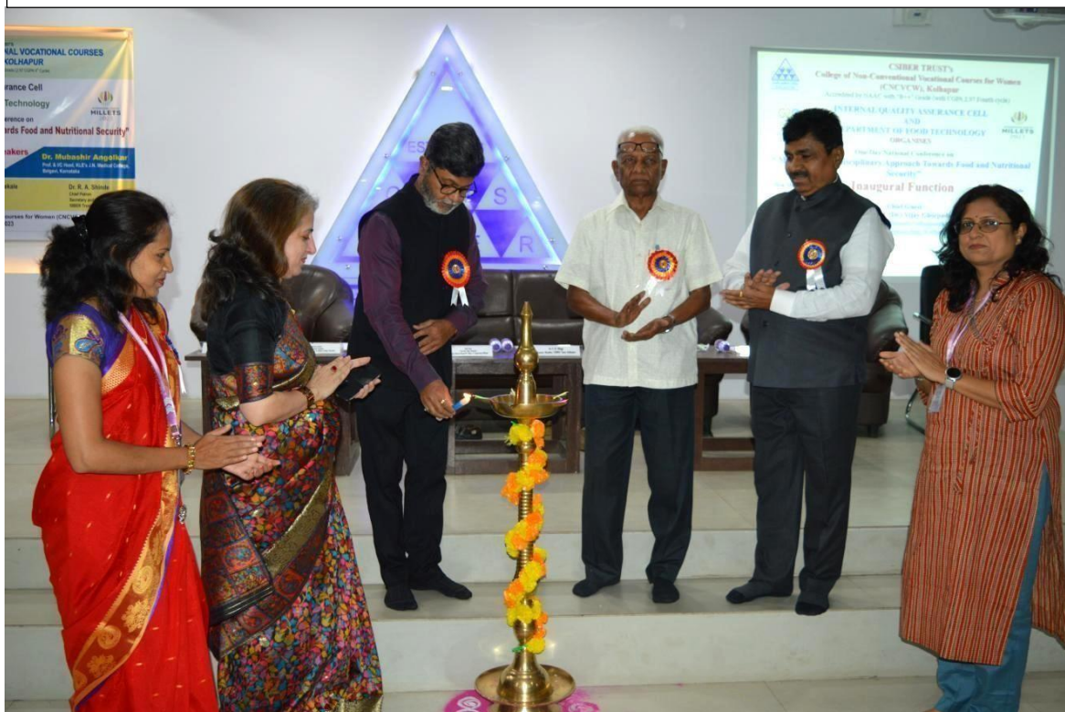
National Conference organized by Department of Food Technology