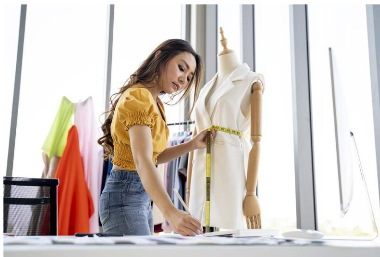
Designer working on her Creation