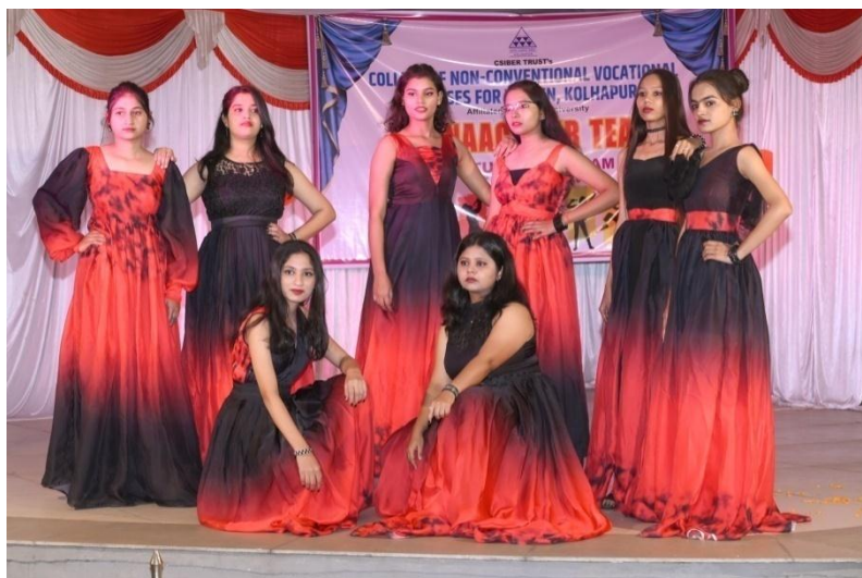
Fashion show by the 3 rd Year student