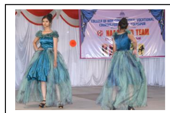
A fashion show by students.