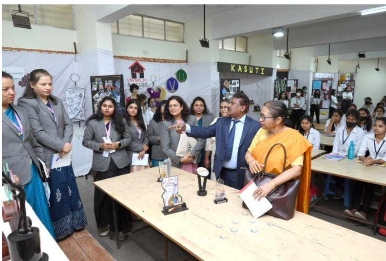
NAAC Peer Team Visit to the Fashion Design Department