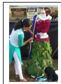
Student designing botanical garment for a competition