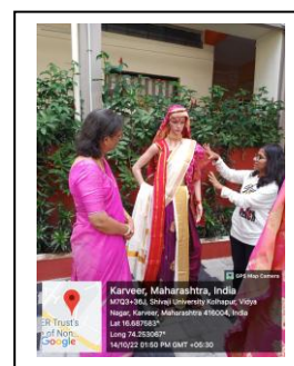
Student introducing her creation