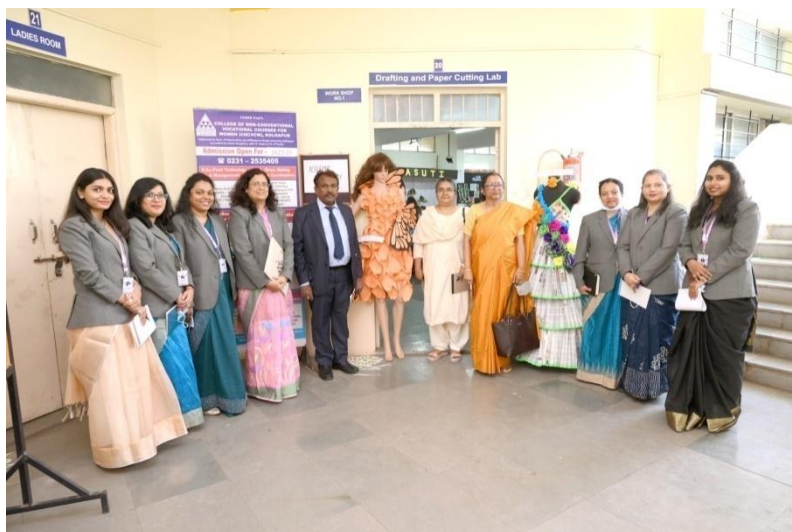
NAAC Peer Team with Fashion Design Department Faculty