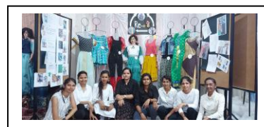
Display by fashion design students.