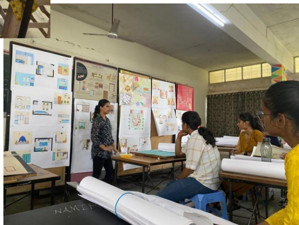
BID students presenting their work