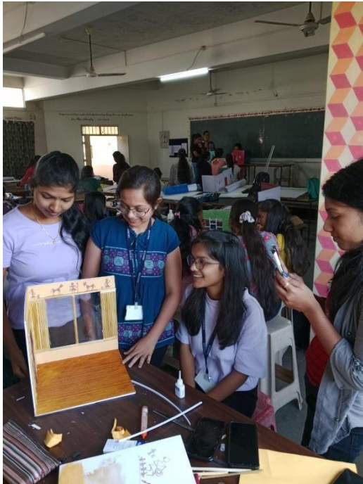
BID students working in model making workshop