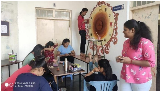
BID students working for annual Exhibition