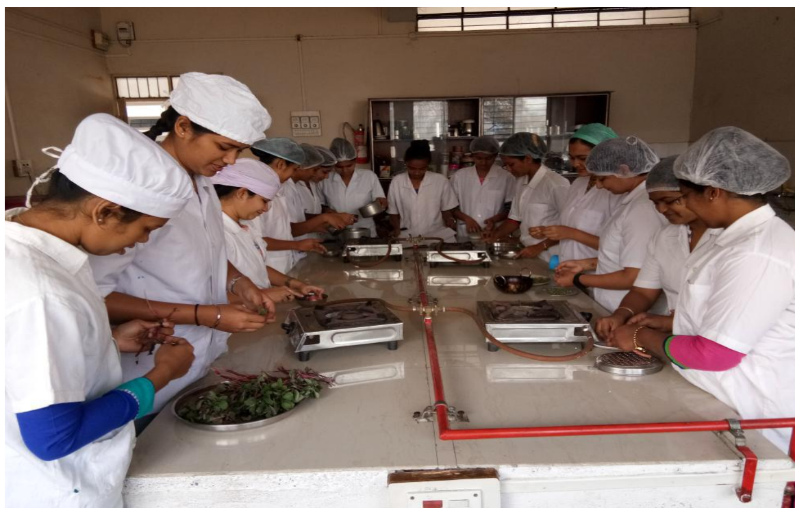
Food Processing Laboratory

Well-equipped classrooms and laboratories with ICT facility are available in the campus.