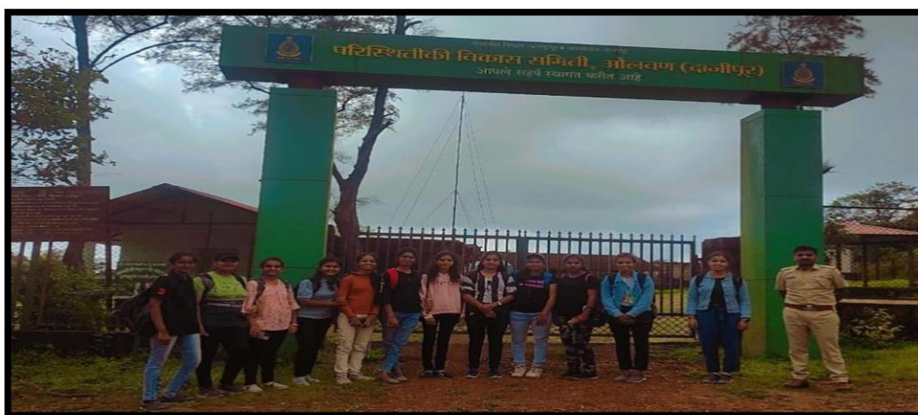
Visit to Wildlife Sanctuary