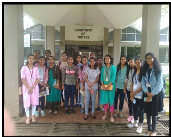
Visit to Lead Botanical Garden at SUK