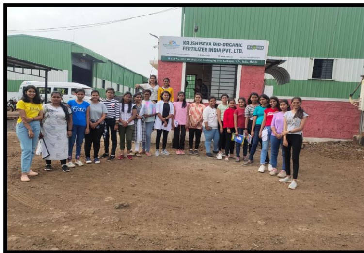
Field Visit at Biofertilizer Plant, Hiralge.

Department of Environment Science has MoU with Bureau Veritas Certification✓, India and Green Friends Eco-Management Industry, Hiralge, under which various types of trainings, visits, workshops, competitions etc. are conducted for the students.