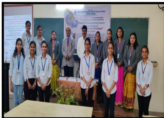
One Day Lead College Workshop