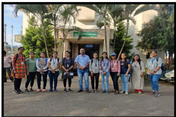
Common Effluent Treatment Plant