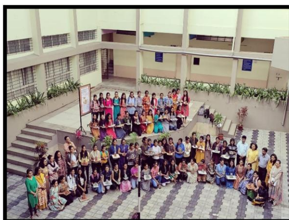
Eco-friendly Lord Ganesha Idol making workshop