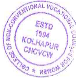
PRINCIPAL, College of Non-Conventional Vocational Courses For Women Kolhapur.

As a part of admission process, college gives admission to students to various programmes purely on merit basis following the reservation policy of Government of Maharashtra (50% open 50% reserved). Before the admission, applications received from the students are scrutinized and then the merit list is prepared. In last five years it is observed that number of applications received under respective reserved quota is less than the seats reserved from the Government of Maharashtra. This is the main reason for lower admissions under reserved categories. In such cases vacant seats under reserved category are allotted to the students of open category. This results in higher number of admissions under open category than allotted quota of 50%.