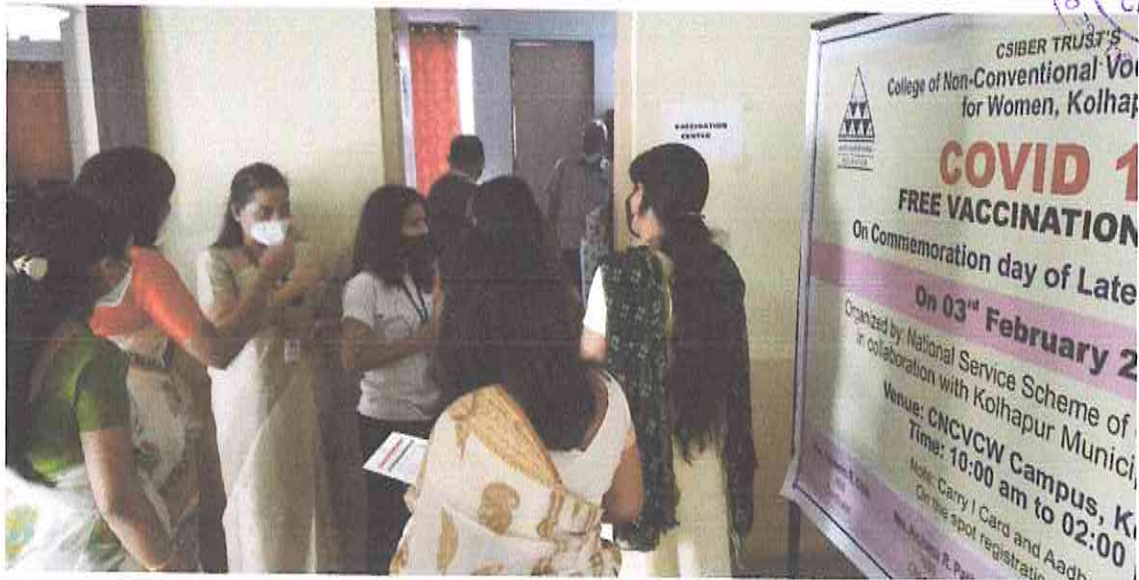
NSS Committee members and Volunteers giving the guidelines of Drive.