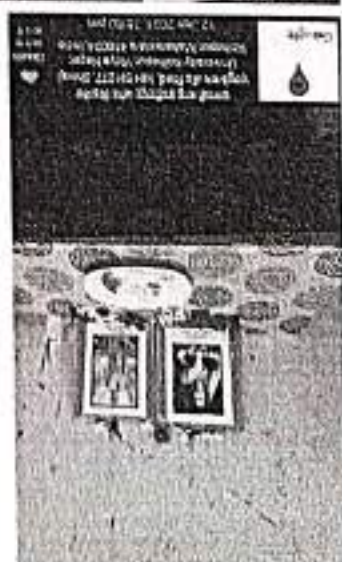
All staff members paid tribute